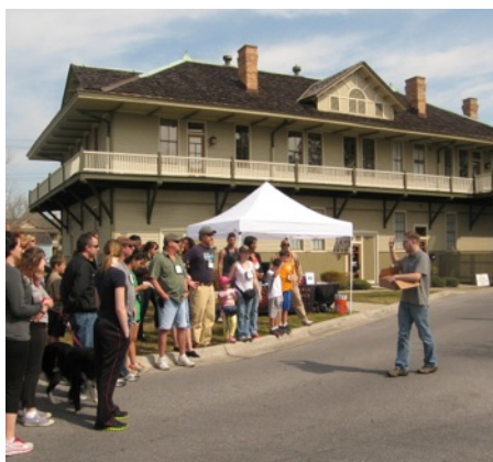
Participants get ready to race at last year's Dash through the Past event!

Afterward, participants are encouraged to get