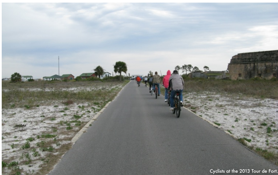
Cyclists at the 2013 Tour de Fort.

dirty by rough sorting artifacts from excavations conducted by the University of West Florida in the FPAN Public Archaeology Lab at the Coordinating Center until 2:00pm!