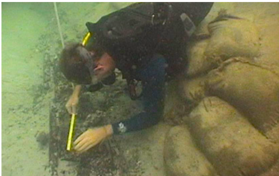
University of West Florida maritime archaeology students work on recording and excavating the Santa Rosa Island Shipwreck, a Spanish frigate wrecked in Pensacola Bay in 1705.

This event is free and open to the public, though attendees are responsible for National Park entrance fees.