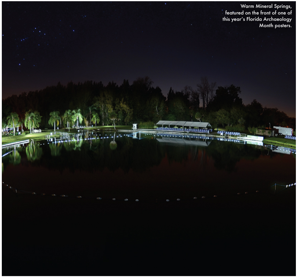
Warm Mineral Springs, featured on the front of one of this year's Florida Archaeology Month posters.