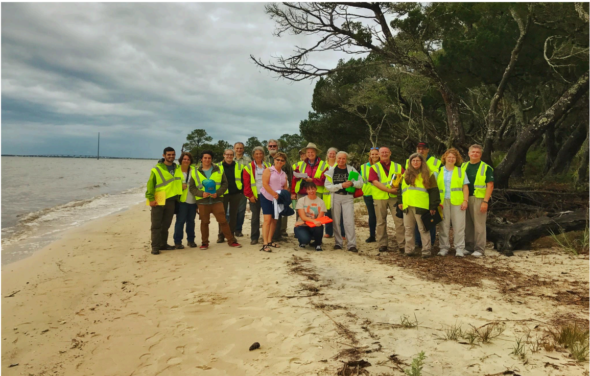
The HMS workshop attendees at the Apalachicola National Estuarine Research Reserve.